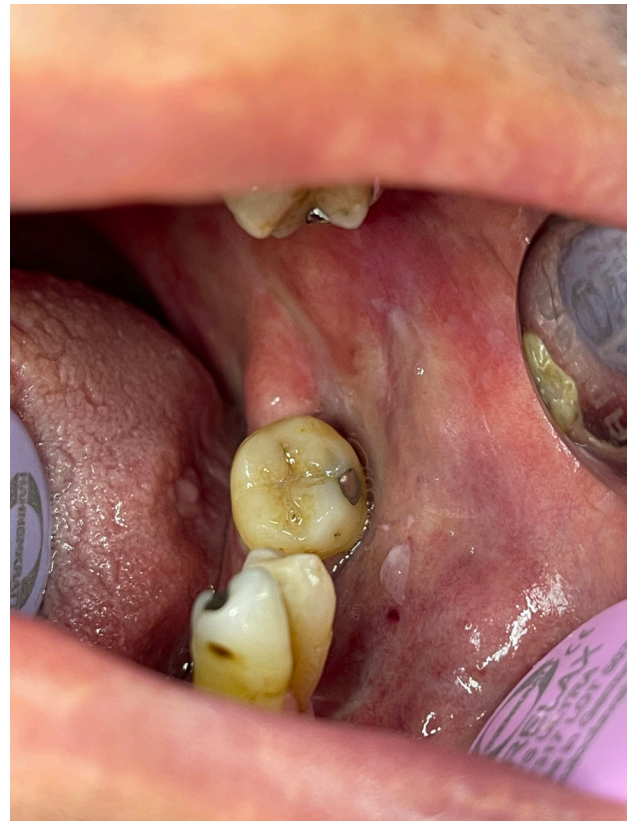
Figure 2. Clinical aspect after first laser session